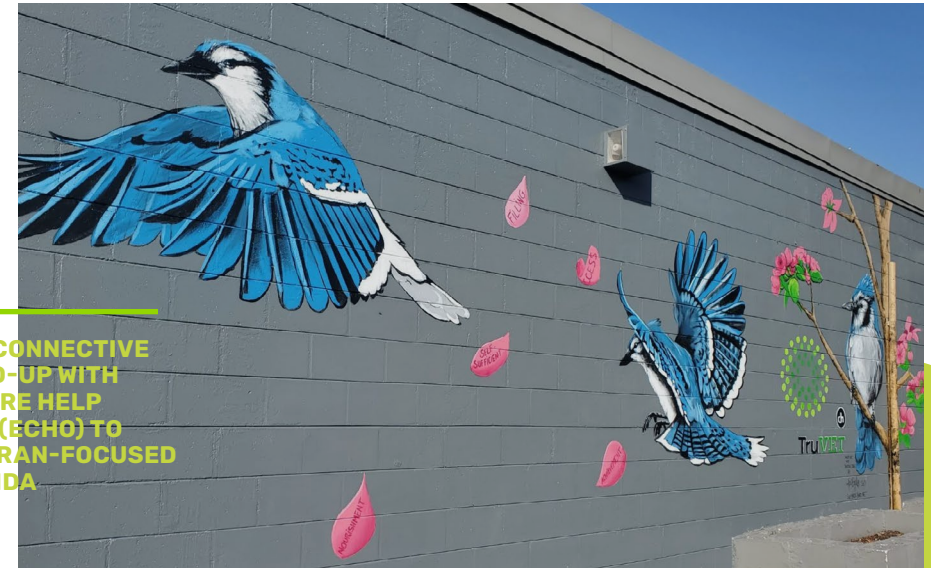
TRULIEVE AND CONNECTIVE HUMAN TEAMED-UP WITH EMERGENCY CARE HELP ORGANIZATION (ECHO) TO CREATE A VETERAN-FOCUSED MURAL IN FLORIDA.

When edibles were first introduced in the state of Florida in September 2020, Trulieve made the first sale of the state to a military veteran and member of the Company's TruVet program. And a few days later, its first sale of a partner product was sold to a disabled military veteran.