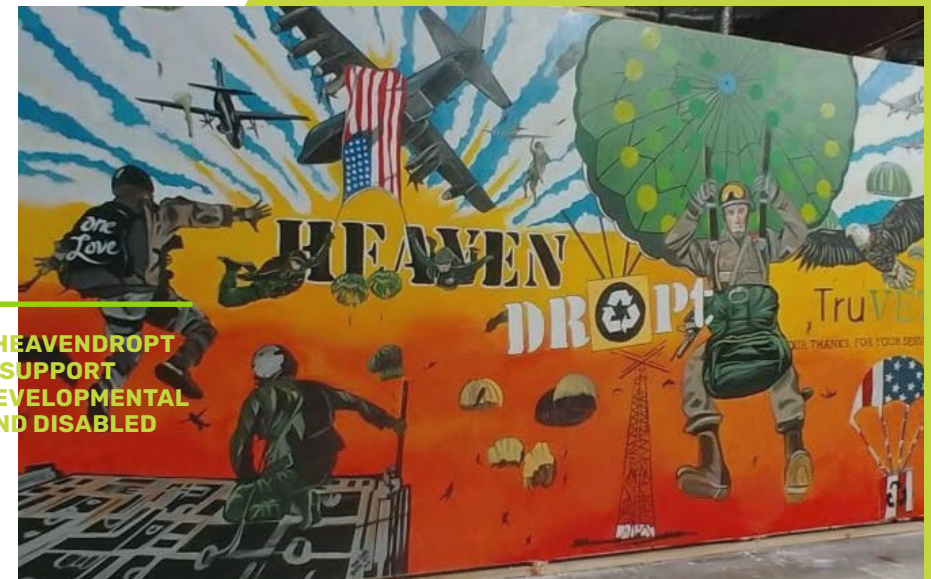
TRULIEVE AND HEAVENDROPT TEAMED-UP TO SUPPORT PEOPLE WITH DEVELOPMENTAL DISABILITIES AND DISABLED VETERANS